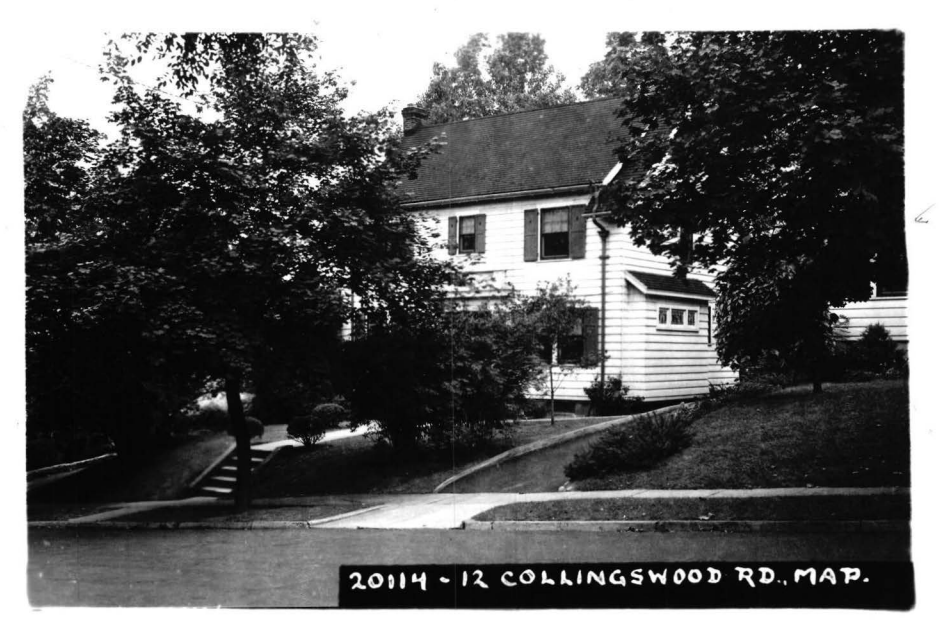
Board of Realtors of the Oranges and Maplewood